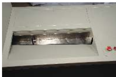
Hand Feed Station